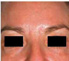
Before and after 3 treatments.