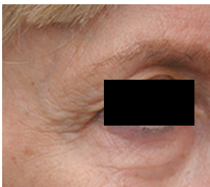
Before and after 4 treatments.