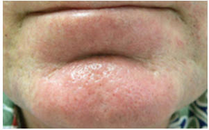
Before and after 1 treatment.