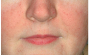
Before and after 6 treatments.