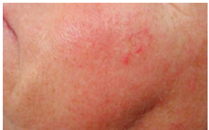
Before and 6 weeks after 2 treatments.